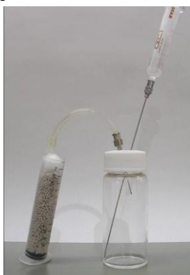
Fig.5.1. Draw the sample from syringe vial.

Note : these reagents does not correspond to Fritless cell.